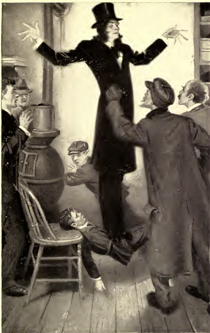
"BE NOT ALARMED, FRIENDS. THE SUBJECT IS IN NO DANGER."